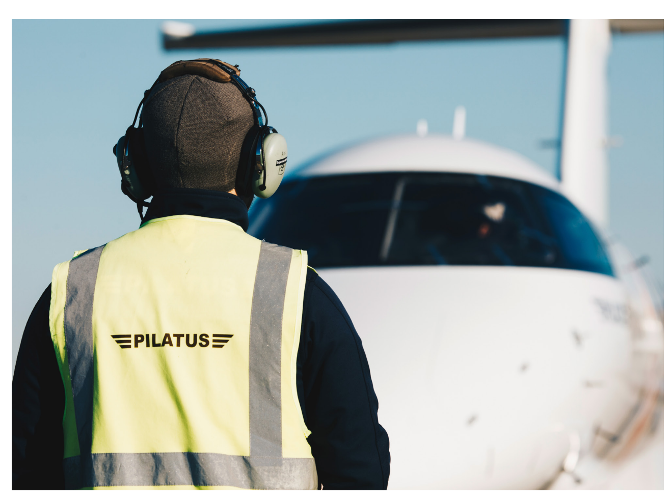
Mobile Recovery Service